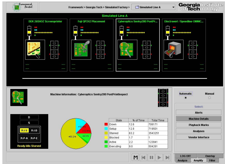
Figure 3. Framework portal showing machine utilization graphs.

The Framework Portal has been progressively developed with a mixture of static design placeholders and active capabilities. Each distinct area is developed as a separate widget to permit the corresponding individual information display item, for example, machine state, to first be developed as a separate stand-alone JAVA application and then later integrated into the GUI (please see figure 3).