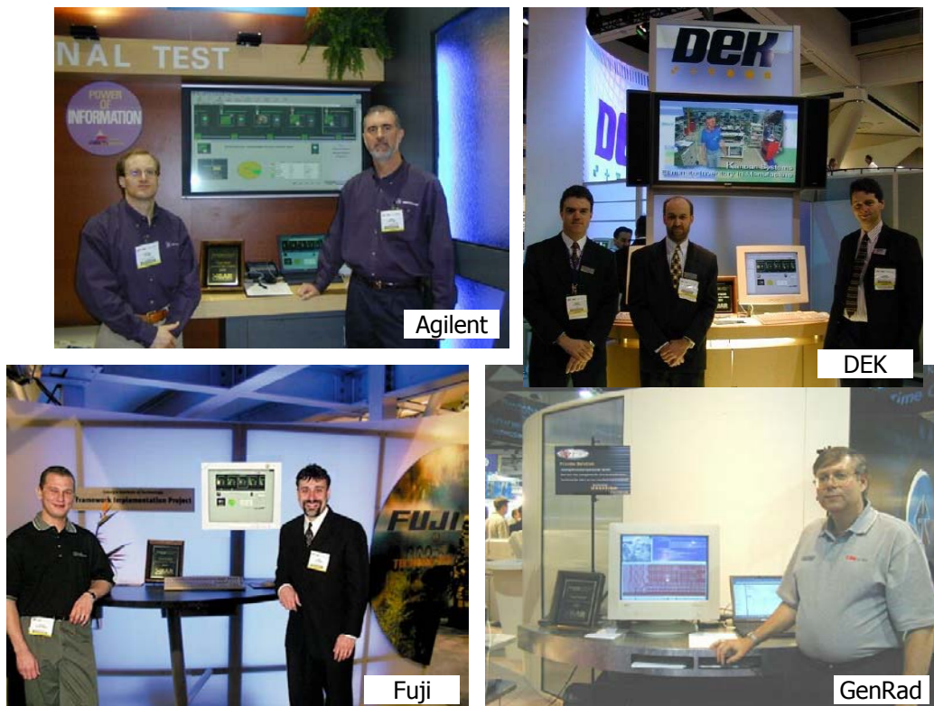
Figure 2, APEX Booth Photos, showing Framework Project software being demonstrated.